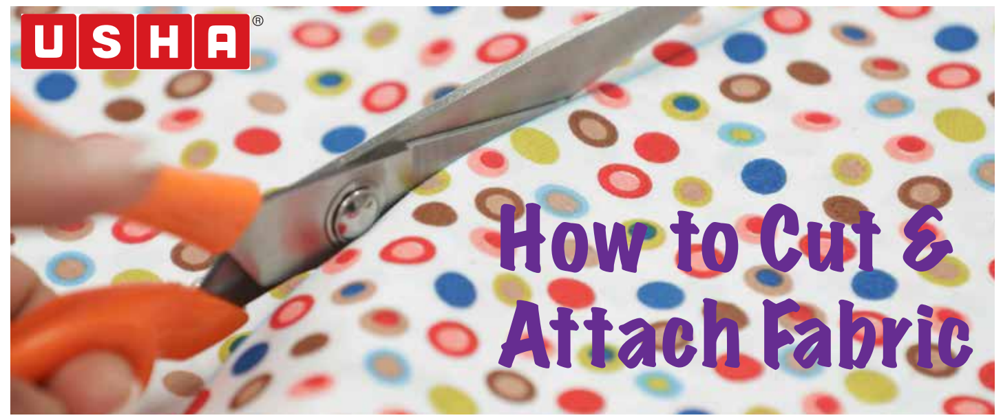
In this lesson we learn how to cut and sew two pieces of fabric together, and finish the edges.