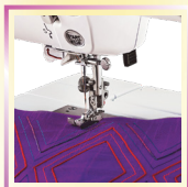
0.65 cm SEAM FOOT